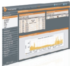
Astaro Security Gateway 110